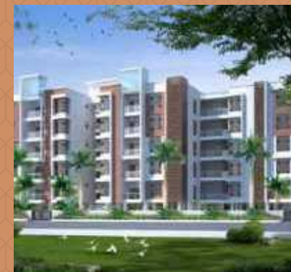
RIVER SHADES @ MANIKONDA