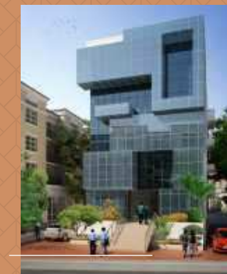
PRASHANTHI TOWERS @ BANJARA HILLS