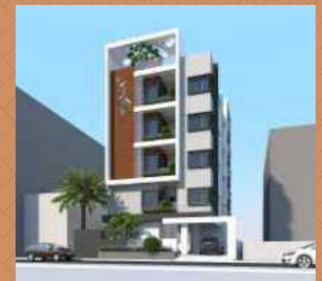
SERENE HILLS @ BHARANI LAYOUT