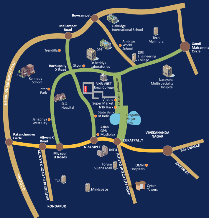
LOCATION PLAN (Not To Scale)