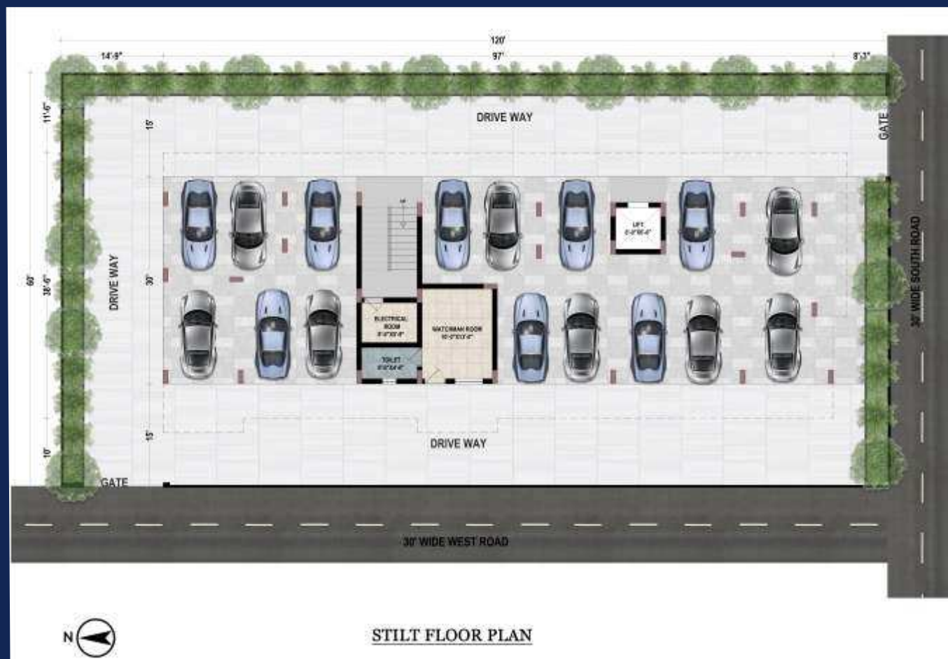
STILT FLOOR PLAN