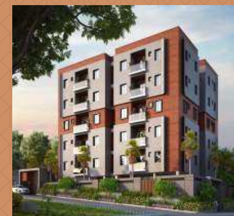
SURYA ELITE @ PRAGATHI NAGAR