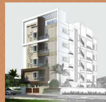
SERENE @ KAVURI HILL